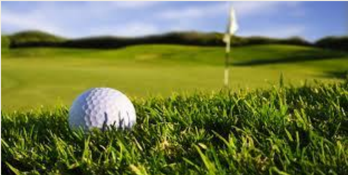
Sierra Lakes Golf Club-January (Season Opener)