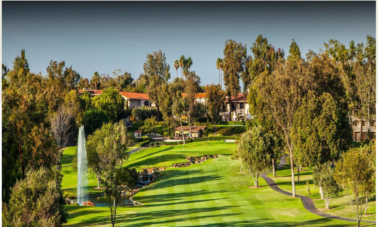
Tee Masters 2025 Annual will be held at the Beautiful Rancho Bernardo Resort August 16-17.